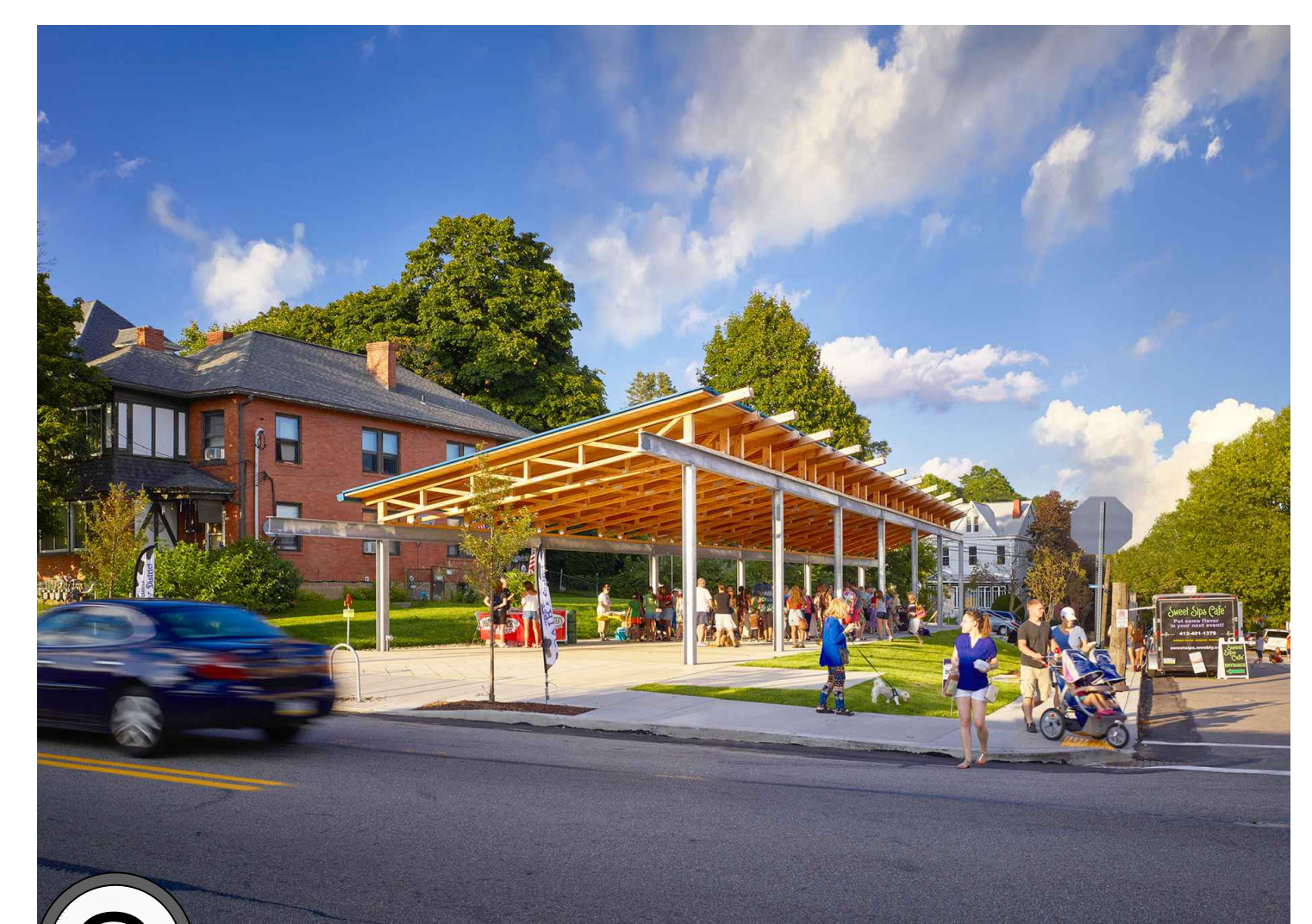
Pocket parks and gathering spaces