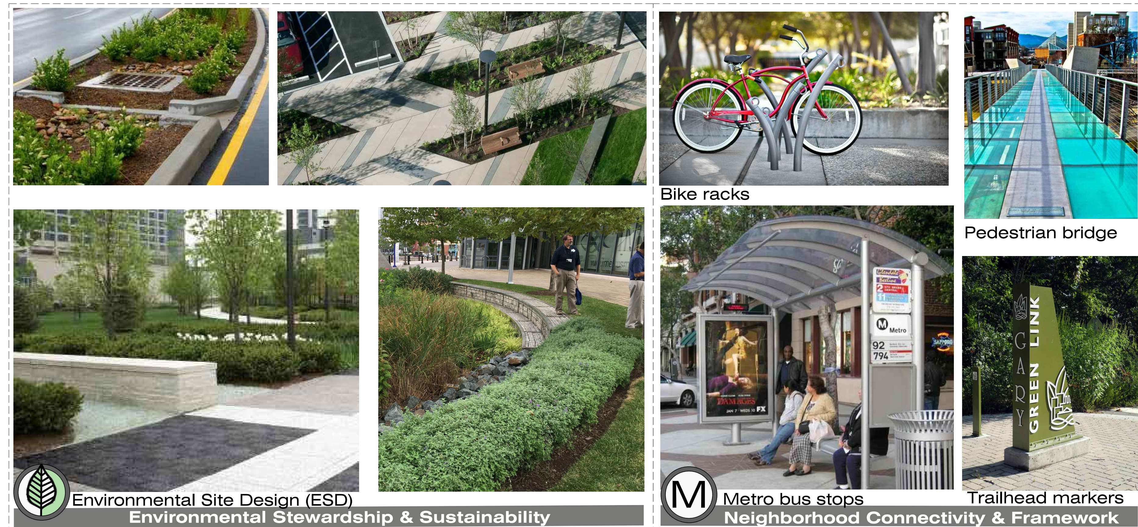
Environmental Site Design (ESD) Environmental Stewardship & Sustainability