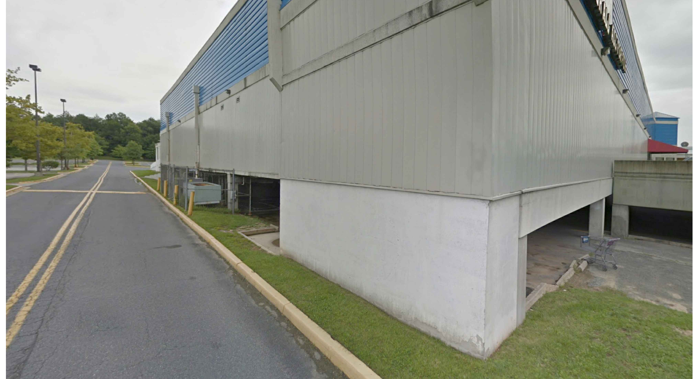
Campus Drive (Before)