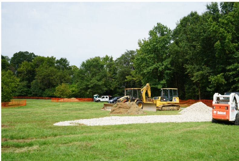
Day 2—Mobilization and Installation of Sediment and Erosion Controls