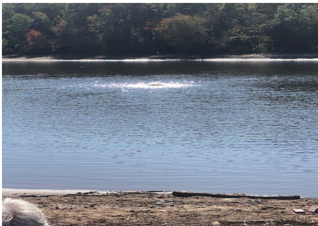
Aerators being installed at the Lake to increase dissolved oxygen levels for aquatic life.