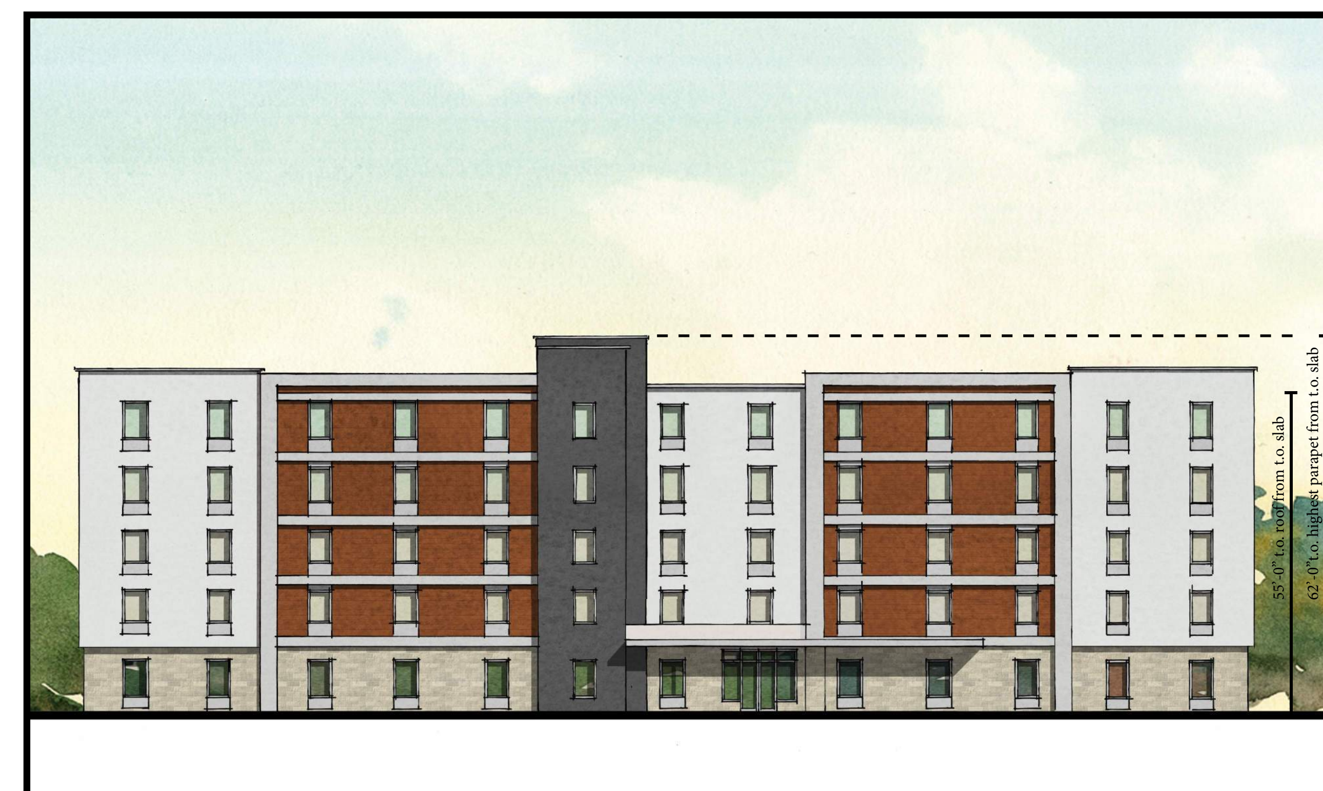
Breezewood Drive Elevation (A)