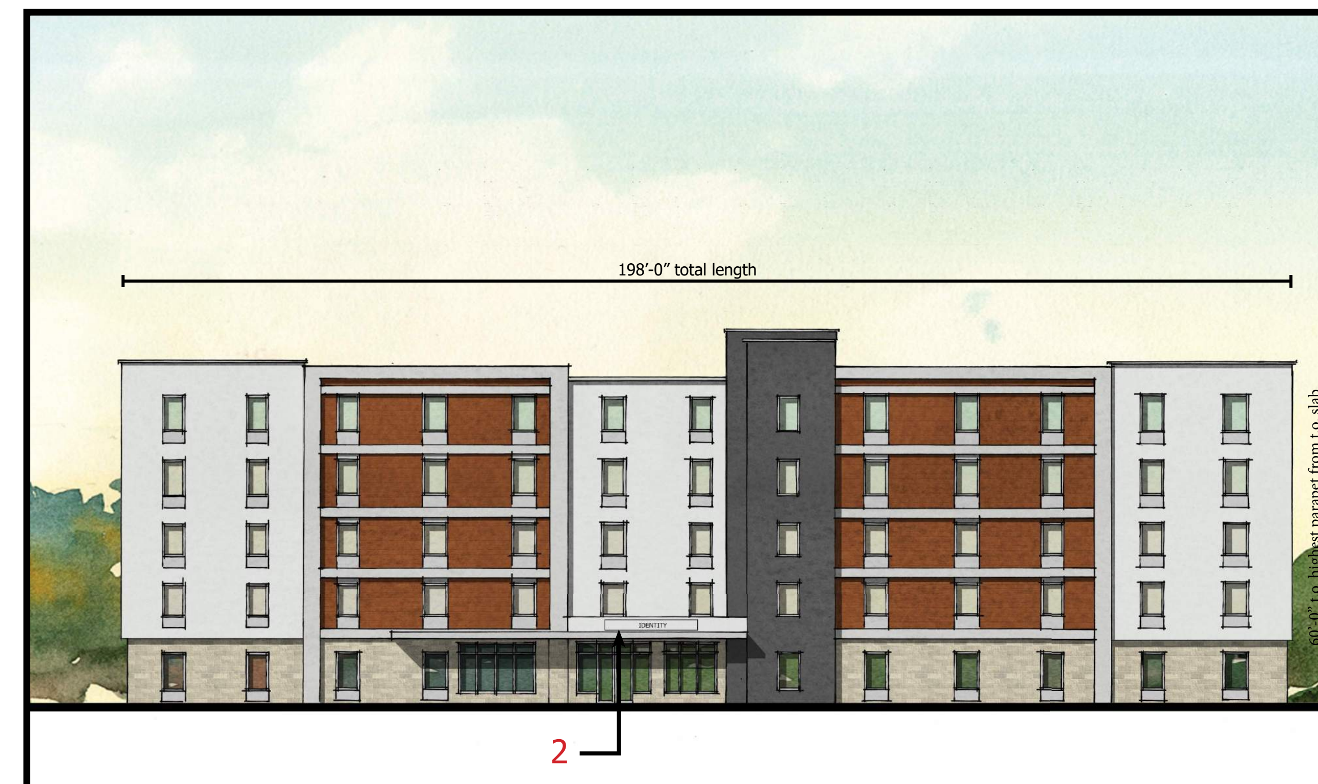
South Elevation (C)