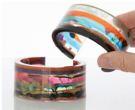
Pictured: Bracelets by past Sparkle Mart participant Lincoln Street Design